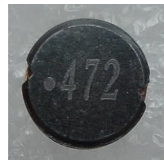
Marking with Laser-Printing